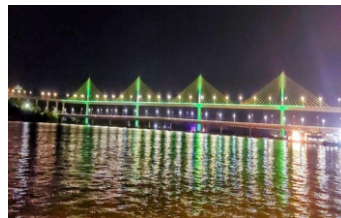
Atal Setu, Goa