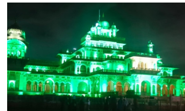
Albert Hall Museum, Jaipur