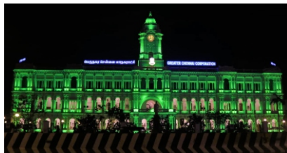
Ripon Building, Chennai