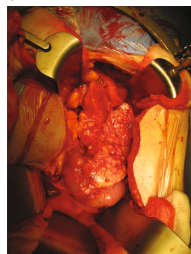
Figure 1 (b) Implanted pancreas

The reasons for lack of pancreas transplantation in our country has been the lack of availability of deceased organ donors. This situation is changing fast with over 900 deceased organ donation in 2022. [7]