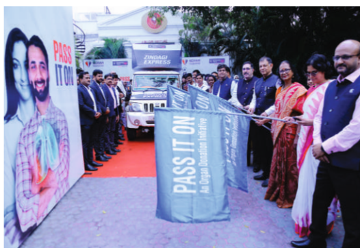
Zindagi Express kickstarts its 5,500km journey across India on January 5, 2023