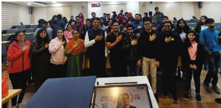
Awareness campaign at IIM Lucknow on January 5, 2023