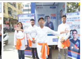
Volunteers creating awareness for the general public as part of the campaign