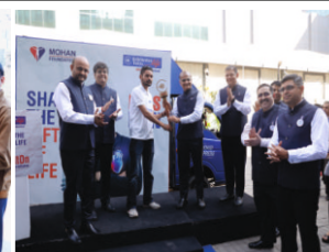
Culmination of the campaign at Bhopal on January 22, 2023