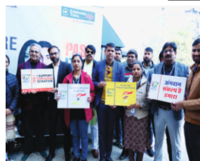
Zindagi Express at Jaipur on January 18, 2023