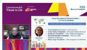
Commonwealth Tribute to Life project launch event - March 14, 2022