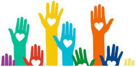
Commonwealth Tribute to Life project initiated in 2018

The Birmingham 2022 Commonwealth (CW) Games present a unique opportunity to showcase organ and tissue donation and transplantation activities of Commonwealth nations towards the noble cause of saving lives.