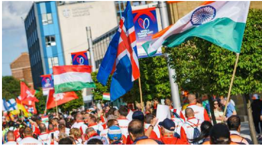
Athletes Parade at the World Transplant Games, 2019

Team Manager, Team India @ World Transplant Games 2023